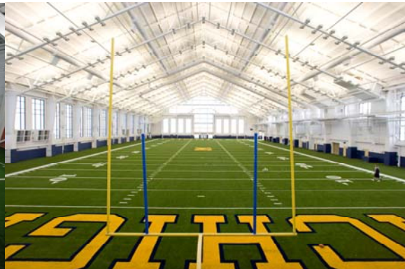
University of Michigan Indoor Complex