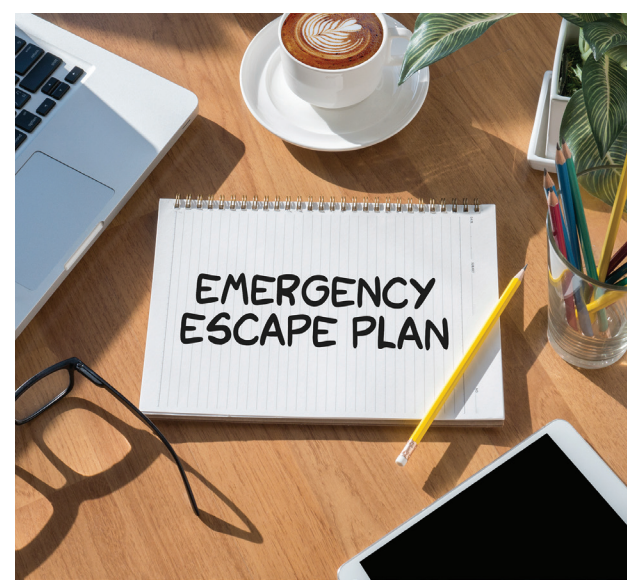
For all emergencies dial